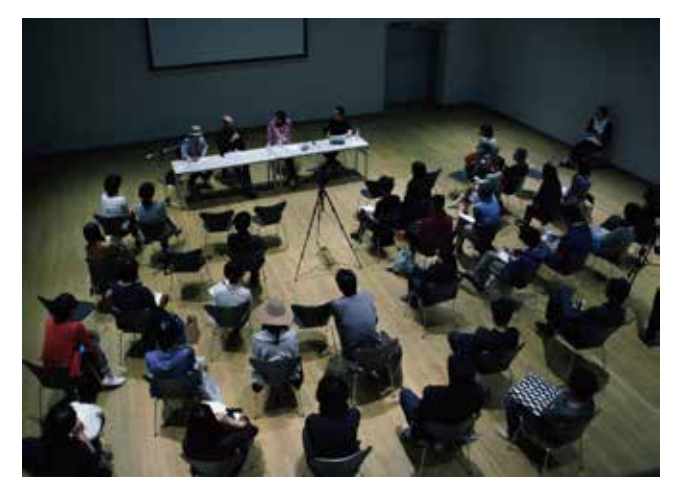
Talk session: Michaek Mack x Satoshi Machiguchi x Atsushi Hamanaka