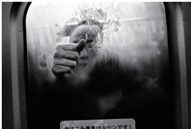
Tadashi Onishi "Shinjuku Morning" (selected by Kotaro Iizawa)